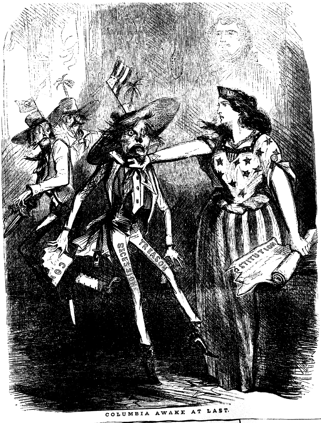
A cartoon published in America in 1861. Columbia represents the Union.

From the Emancipation Proclamation issued by Lincoln on 1 January 1863.