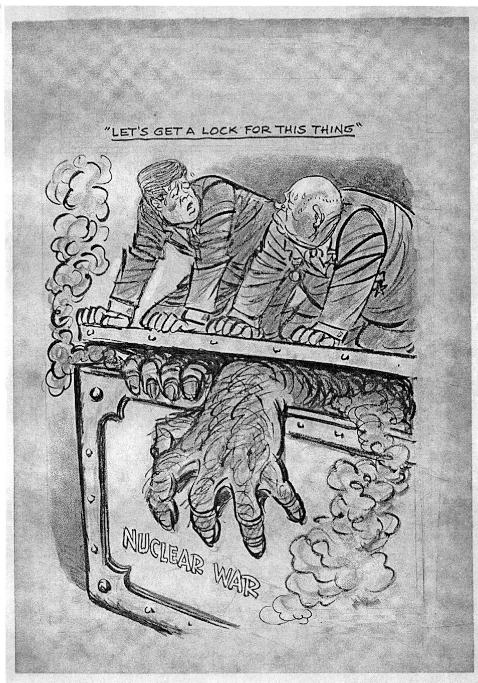
A cartoon published in America, November 1962.