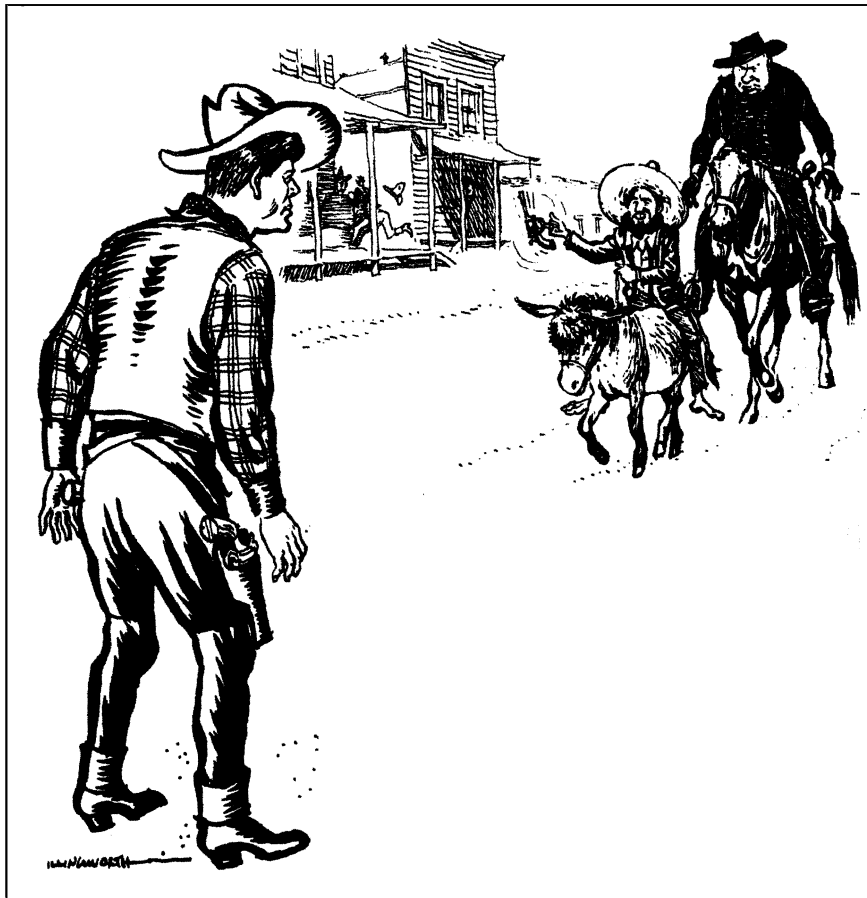
A cartoon published in Britain in October 1962. The figures on the right represent Castro and Khrushchev.